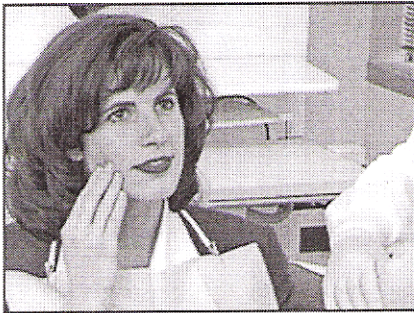
Avoid chewing until numbness wears off